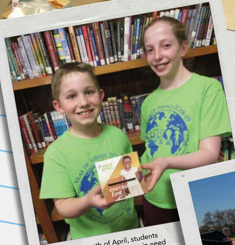
During the month of April, students donated money to help those in need through the Catholic Relief Services Rice Bowl project.