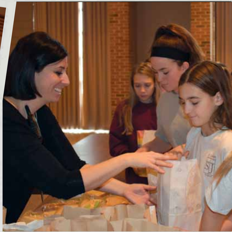
Our school participated in a school-wide service project to help feed the hungry in January.