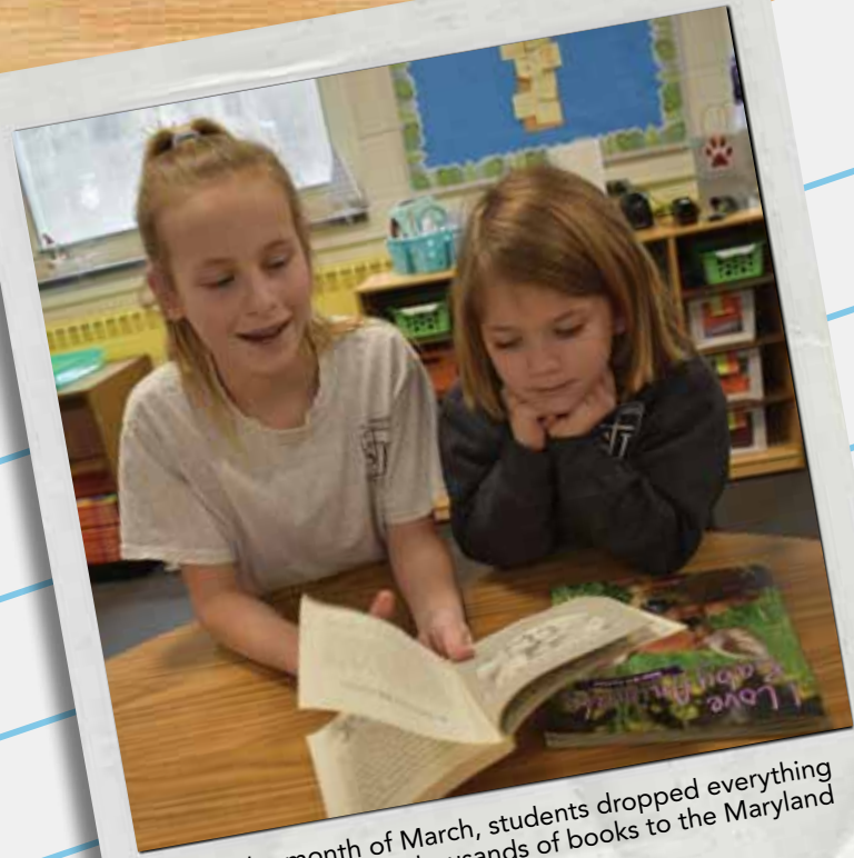
During the month of March, students dropped everything to read and donated thousands of books to the Maryland Book Bank.