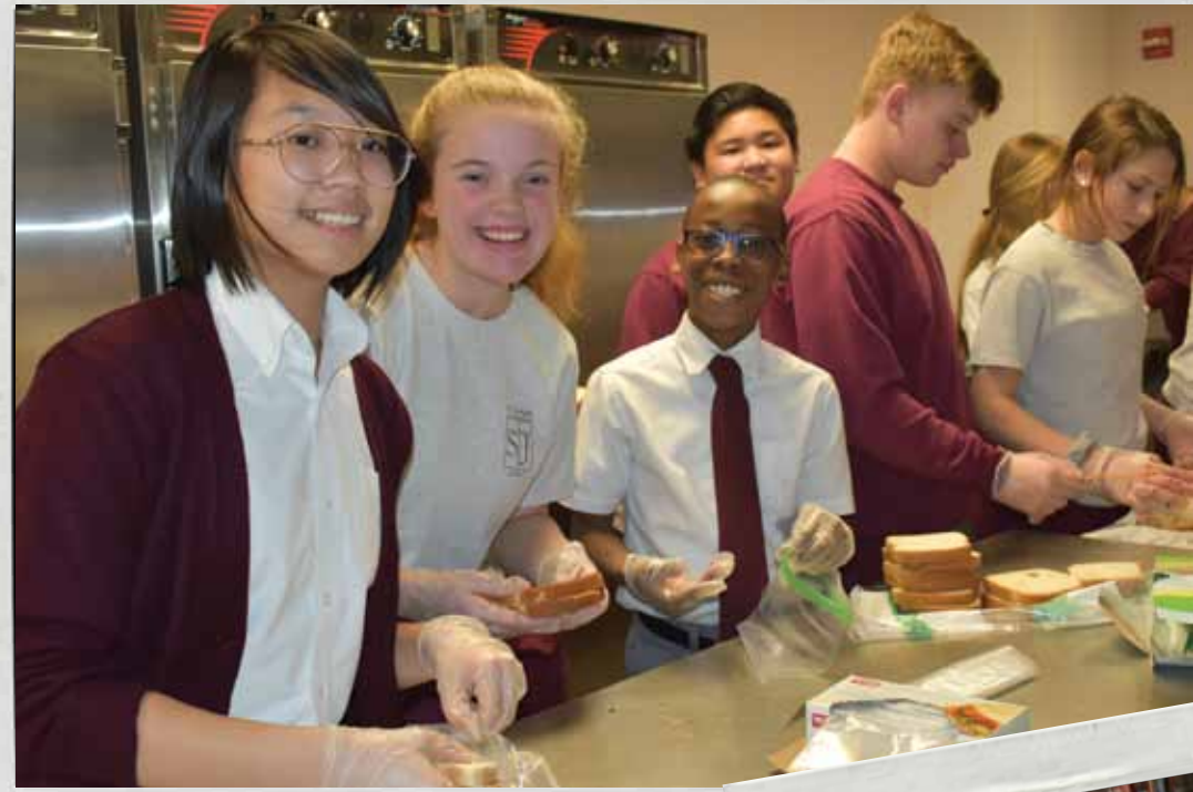
We made 409 bagged lunches for the Weinberg Center and every grade helped by decorating lunch bags, making sandwiches, and filling the lunch bags with food.