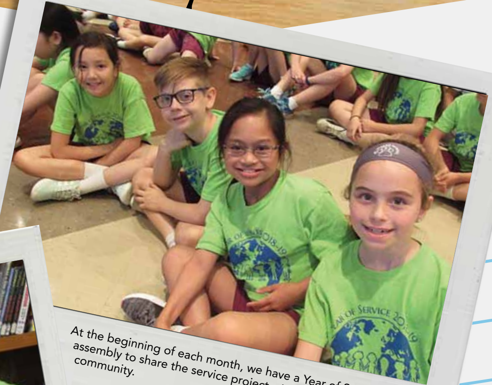
At the beginning of each month, we have a Year of Service assembly to share the service project with the school community.