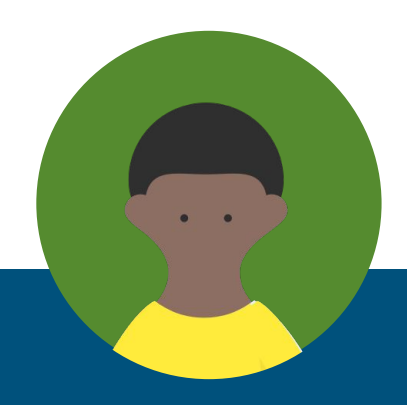
FACTS for Field Trips

All payments for Field Trips will go through our FACTS Billing System this year.