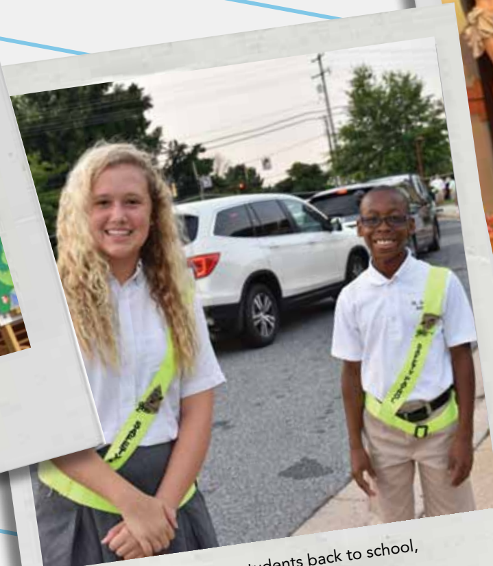
School safeties welcome students back to school, Septemeber 2018.