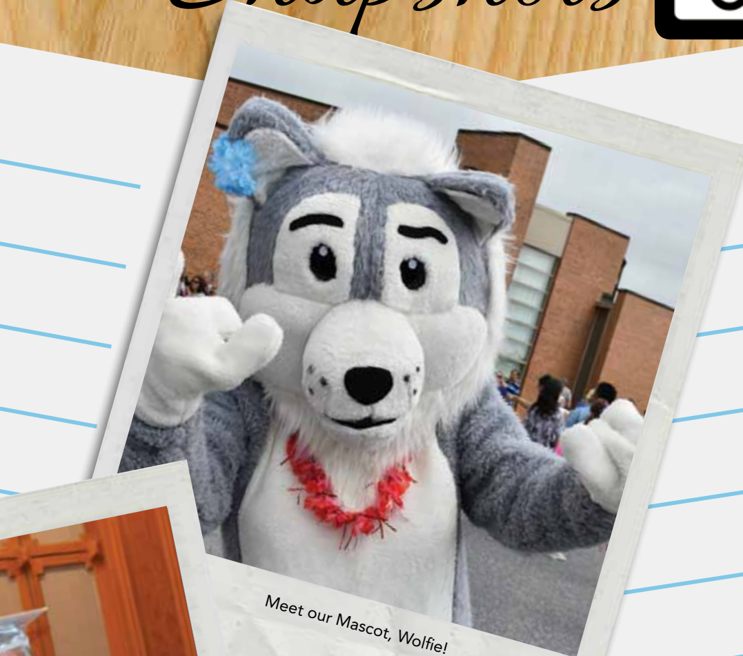
Meet our Mascot, Wolfie!