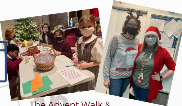
The Advent Walk & Christmas at SJS-Fullerton