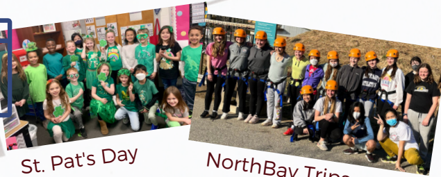
St. Pat's Day NorthBay Trips