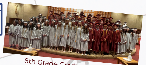
8th Grade Graduation