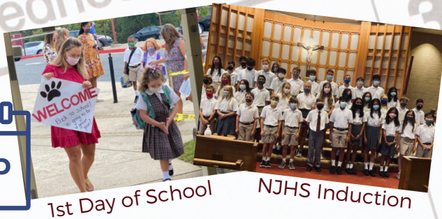
1st Day of School NJHS Induction