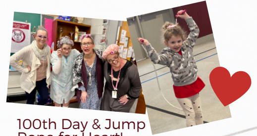
100th Day & Jump Rope for Heart!