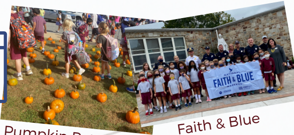
Pumpkin Patch Day Faith & Blue