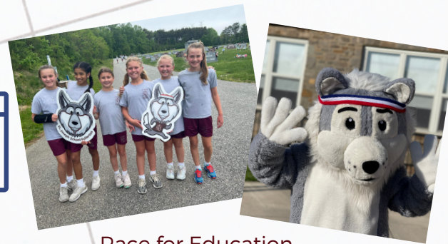
Race for Education