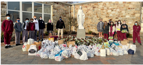
Giving back through the canned food drive