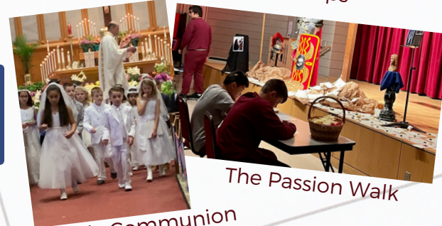
The Passion Walk First Holy Communion