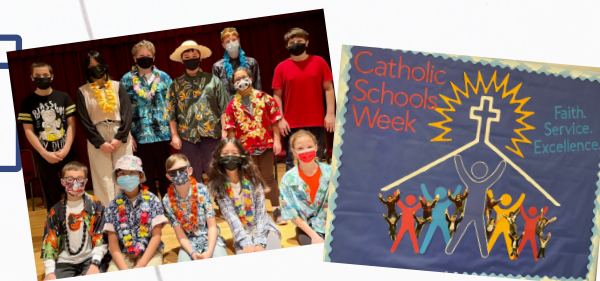
The Catholic Challenge & Catholic Schools Week