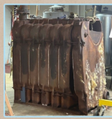
Old air handler system being demolished to make room for the new system