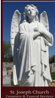
St. Joseph Church Cemetery & Funeral Services